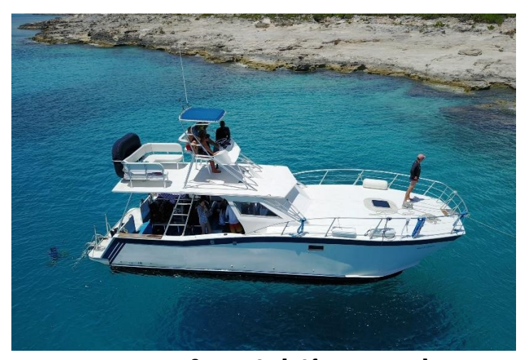
MV LIVE & DIRECT [40ft power cat]