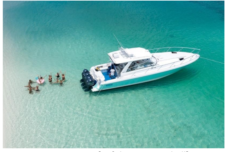
MV SERENITY [48ft luxury monohull]