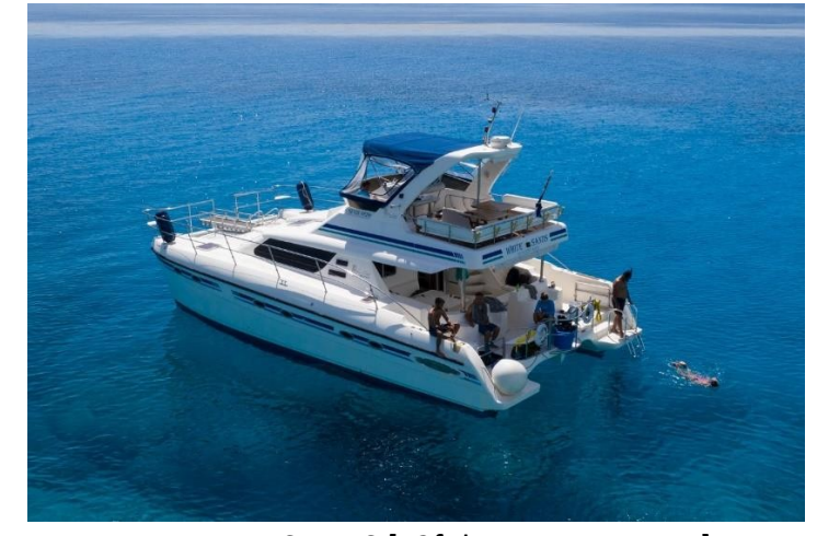
MV WHITESANDS [42ft luxury power cat]

Leeward | Providenciales | Turks & Caicos Islands O.+1 649.946.5034 C.+1 649.231.6455 info@bigbluecollective.com | www.bigbluecollective.com