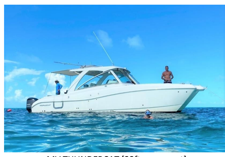
MV THUNDERCAT [32ft power cat]