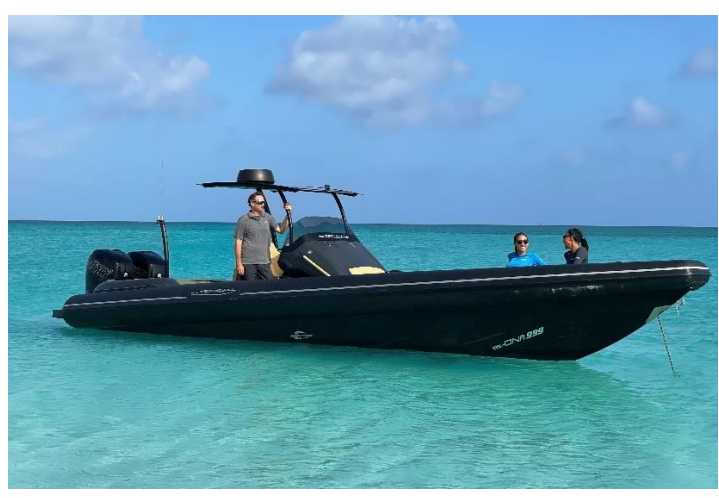
MV SKYFALL [34ft RIB]