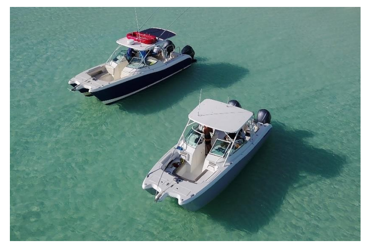
MV GRACIE & MV LITTLE CHILL [30ft power cats]